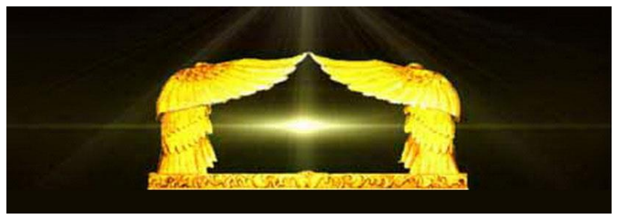
The mercy seat

The mercy seat unlike the chessboard was made of PURE gold. Gold speaking of divinity. Here we have the three persons of the Godhead in their divinity . The three persons in the Godhead are in a circular structure with the Father and the Holy Spirit forming 2/3 of the circle. The Son completes the circle but because He had been slain with blood sprinkled upon Him, He is seen as laying down. This posture speaks of the depth of His suffering.